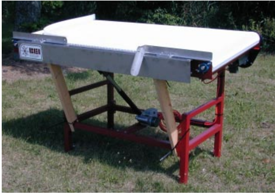
Picture shows Tilt Belt with shipping braces

BEI's Tilt Belt provides an effective means of removal for soft berries and trash. When a firm berry travels across a moving Tilt Belt, it will roll directly across it. A soft berry will be carried along the belt. A gradient of firm to soft berries will be discharged off the side of the belt. Small amounts of field trash will be removed.